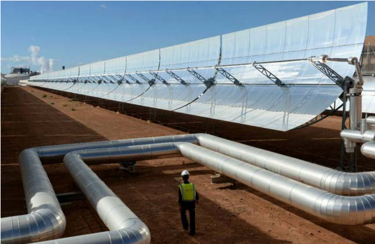
Morocco's first CSP plant, Noor I, has half a million curved mirrors that slowly follow the sun. The sunlight is concentrated on a pipe filled with oil that is used to create steam to run turbines.

subsidies for several years before the 2008 financial crisis. The technology most commonly deployed is parabolic trough, a system that uses curved mirrors that move on a single axis to track the sun. Sunlight is concentrated on a pipe filled with oil at the focal point of the parabolic mirror. The oil, which can reach around 700 degrees Fahrenheit, is used to make steam to run a turbine. There's no direct thermal storage, though some facilities add a step, using the oil to heat molten salt so it can be stored. This process is less efficient than storage using a CSP tower, however, because of the lower temperatures.