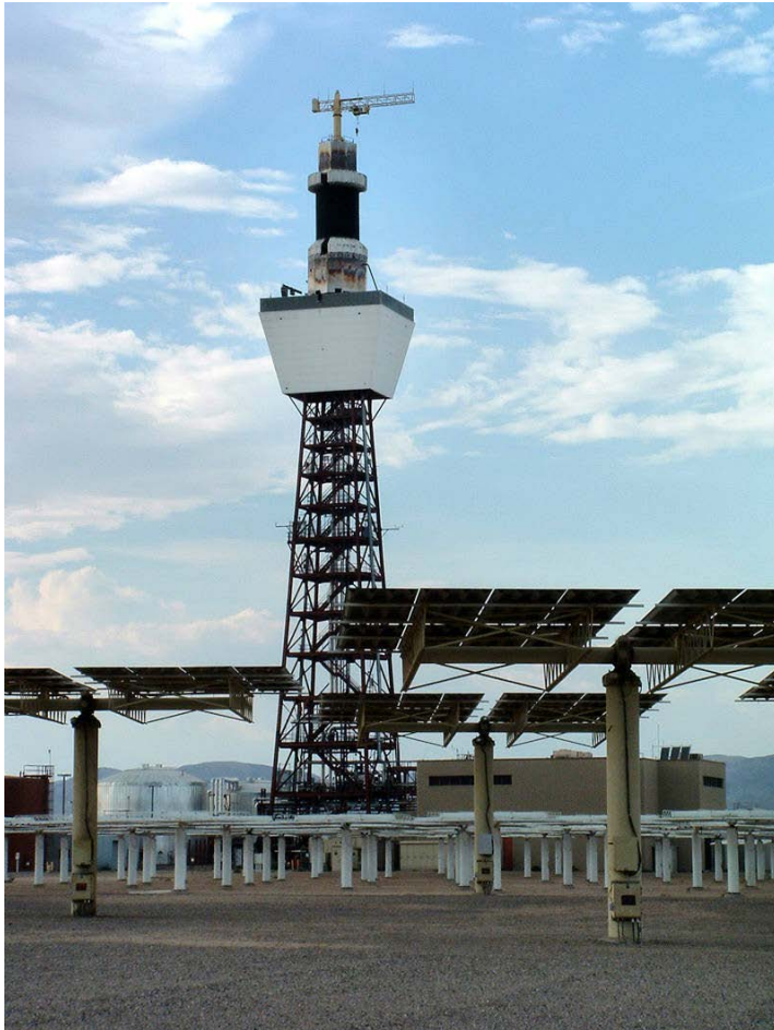
Solar Two was a small pilot project near Barstow, California, where salt storage technology now used at Crescent Dunes was tested in the 1990s.