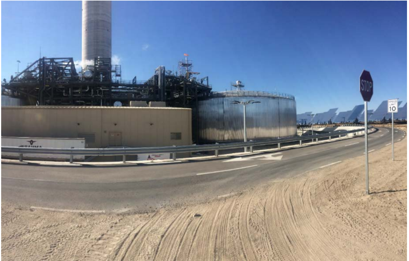
Solar-heated molten salt is stored in giant tanks near the tower at Crescent Dunes.

temperature cause expansion or contraction. Instead, due to a construction error, it was all welded together, and temperature changes caused the bottom of the tank to buckle and leak.