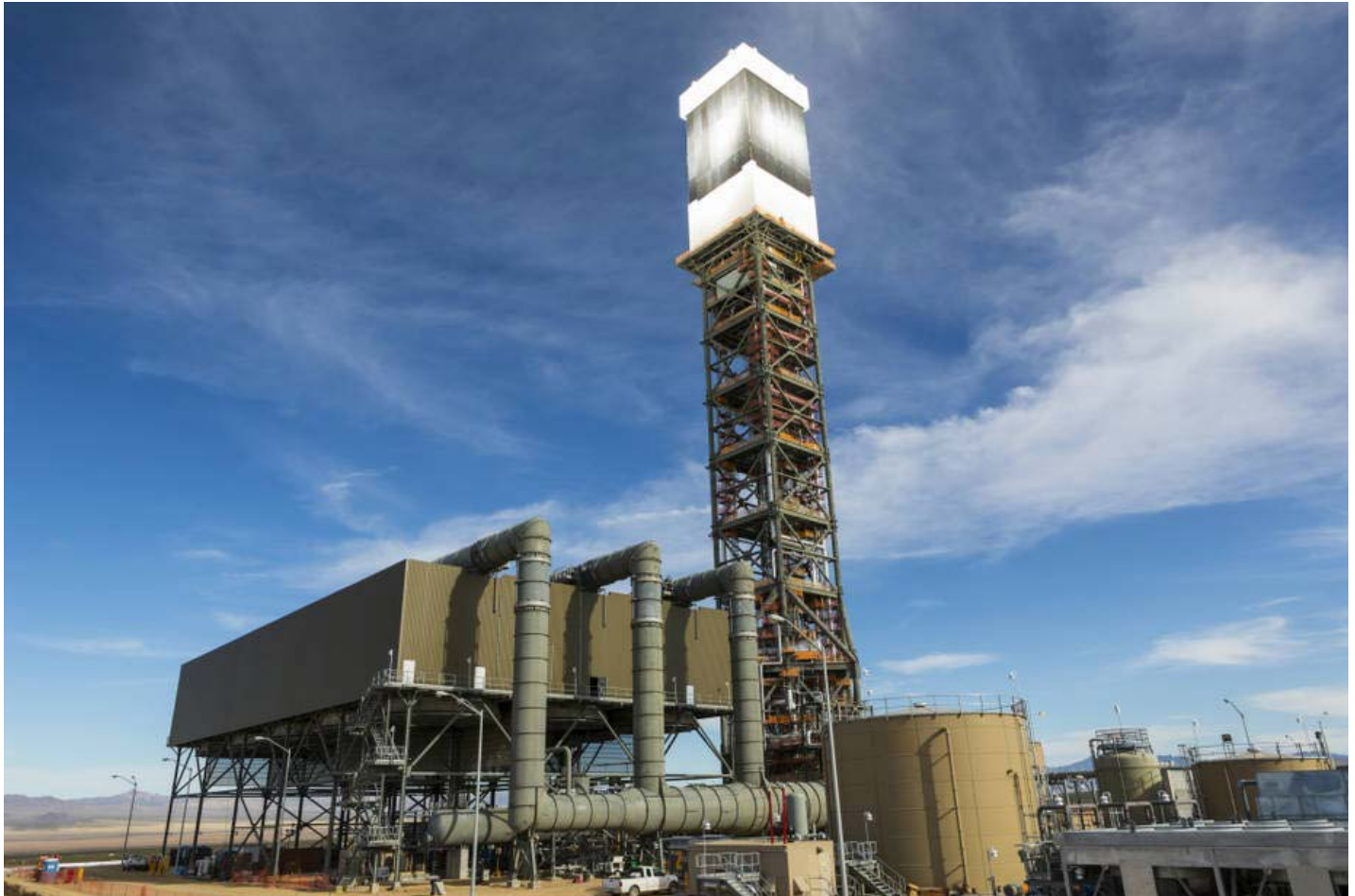
Ivanpah, in California's Mojave desert, went into operation in 2013 as the world's largest solar thermal power plant. Its receivers generate steam to run turbines.

The other significant type of CSP plant uses a central tower and heliostats to heat steam instead of salt. These plants look similar to Crescent Dunes, but there is no storage; the steam has to be used in the turbine immediately. This is the technology at the 377-megawatt Ivanpah project, located in the Mojave Desert near the Nevada-California border, the world's largest CSP plant. Ivanpah was built with a $1.6 billion federal loan guarantee.