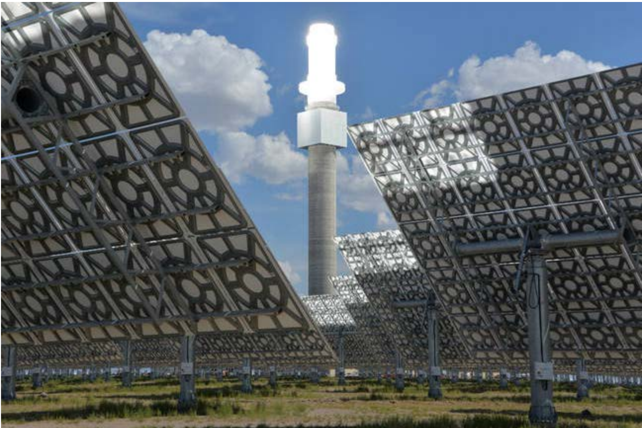
Concentrated solar power plants that use molten salt storage are drawing interest around the world, with several plants planned in China.

Now, the conversation about what the grid really needs seems to have begun in earnest, Smith said. In places such as California, where about a third of the electricity now comes from renewables, there's excess renewable generation during certain hours of the day. If the shift to cleaner, carbon-free power sources is to continue, California, and other systems, will need clean resources that can be dispatched to meet peak demand and to help keep the grid stable. "We believe now is the rebirth of the CSP market. And it's all about storage."