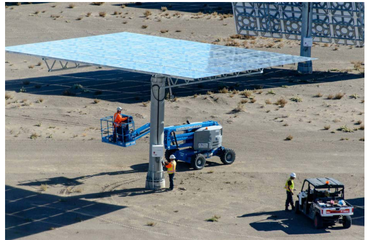
Heliostats, the giant mirrors that focus the sun's rays, are directed by software that allows them to follow the sun through the day.